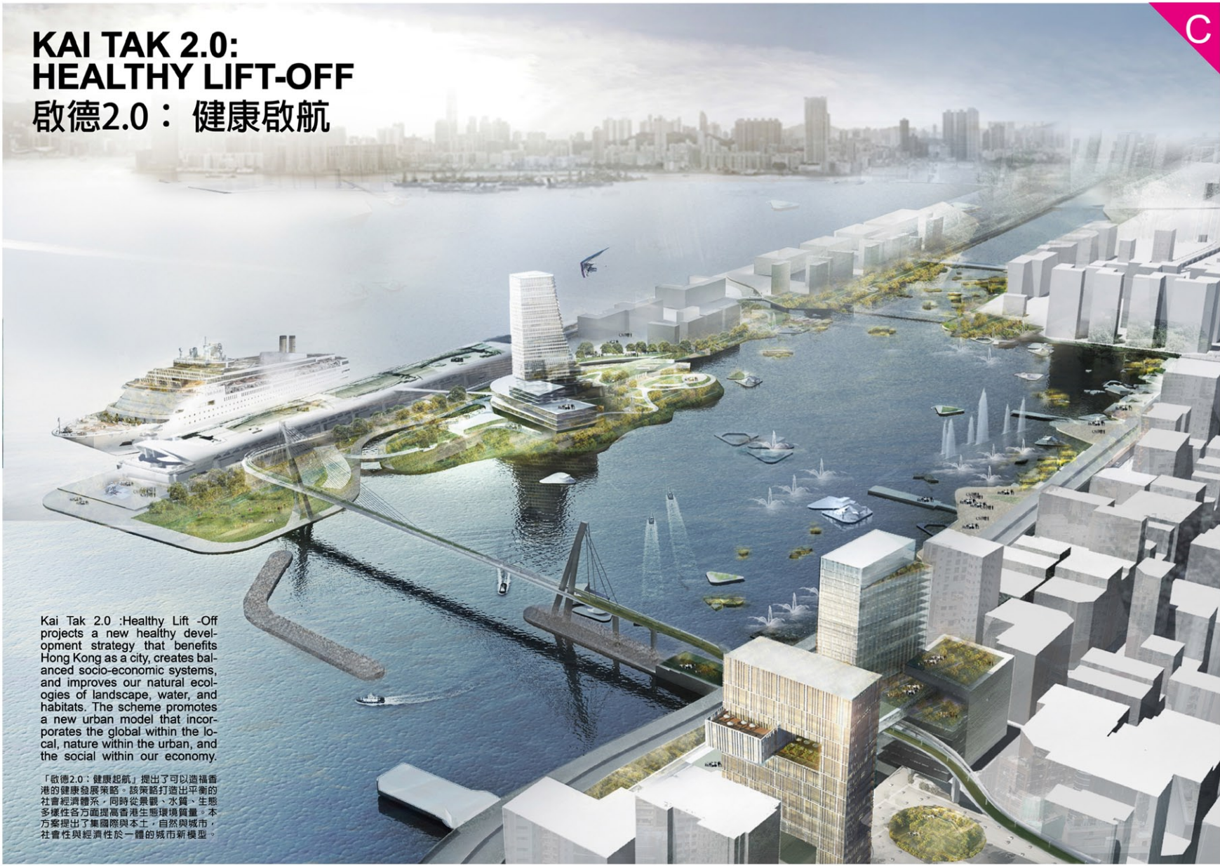
Kai Tak 2.0 : Healthy Lift-off